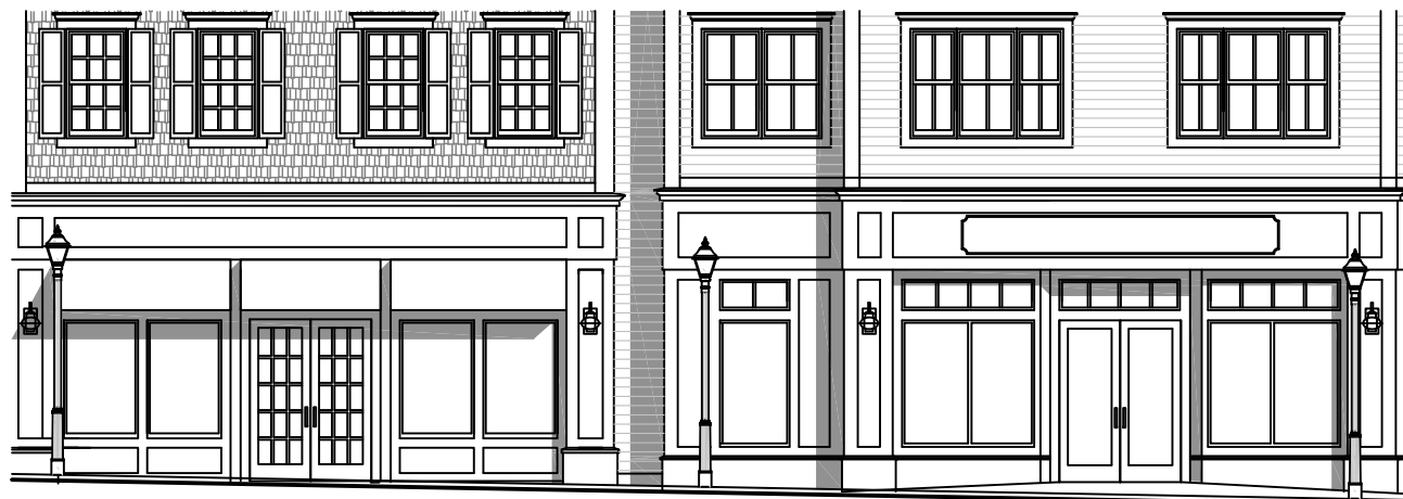
Figure 3: Individual Tenant Storefronts