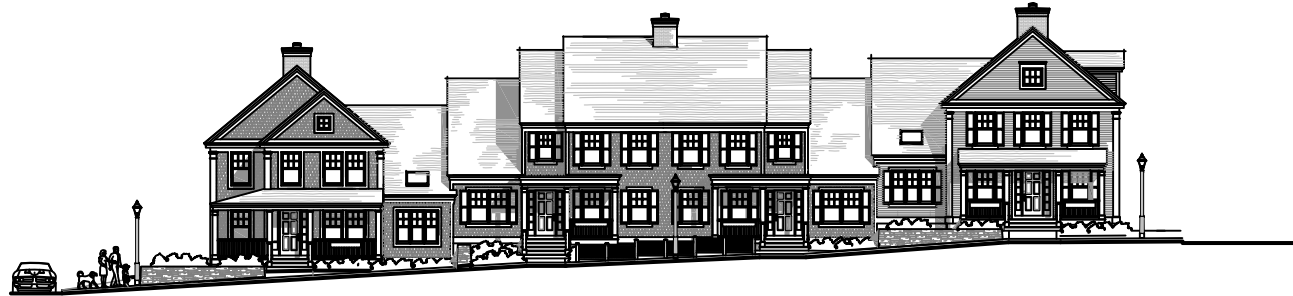
Figure 1: Four Family Residential

The conceptual renderings and building elevations on the following pages illustrate the architectural character proposed for the numerous different building types at Milltown Commons. They illustrate appropriate building scale, mass, proportions, roof lines, cornice lines, architectural details and materials. In addition to following the provisions set forth in the North Stonington New England Village Special Design District zoning regulations, the conceptual designs are meant to serve as a design intent guide for all proposed buildings at Milltown Commons. While final building designs may ultimately vary from the concepts presented here, this guideline establishes the appropriate architectural character for this project by example, not by setting setting strict limits or restrictions on the architecture.