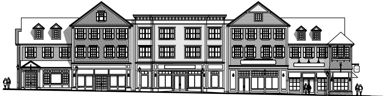
Figure 2: Mixed Use Commercial Residential