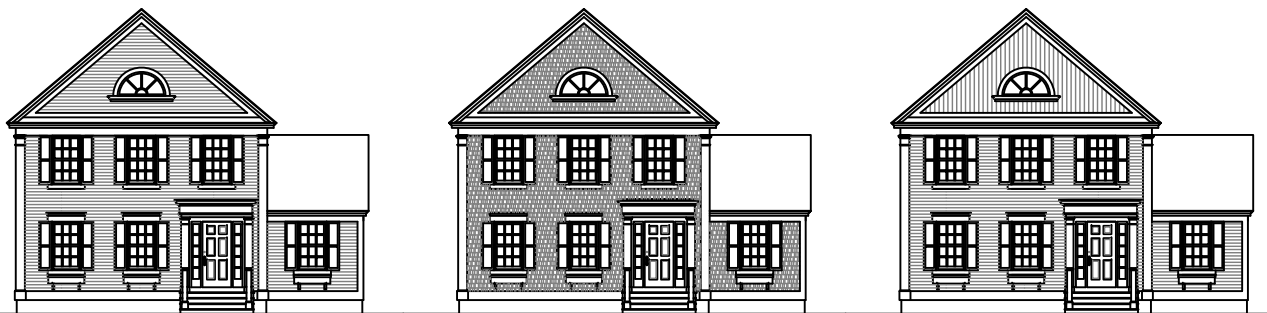
Figure 1: Siding Variation

When applied to the different building types and styles proposed for Milltown Commons, these types of variations offer almost limitless opportunities for creating a diverse architectural landscape while maintaining the appropriate village scale and character.