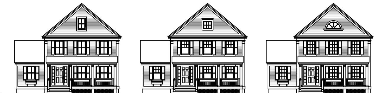
Figure 2: Window Lite Pattern Variation