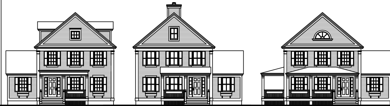
Figure 3: Varied Porch Designs

Although the traditional village setting has numerous different building types and styles, the same basic building forms are often repeated. To create more interesting and varied architectural patterns, different siding materials, window lite patterns, porch designs, additions and color schemes are all used to differentiate these forms (figures 1-4).