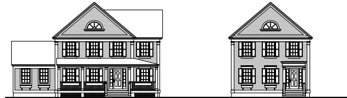
Main Building Form