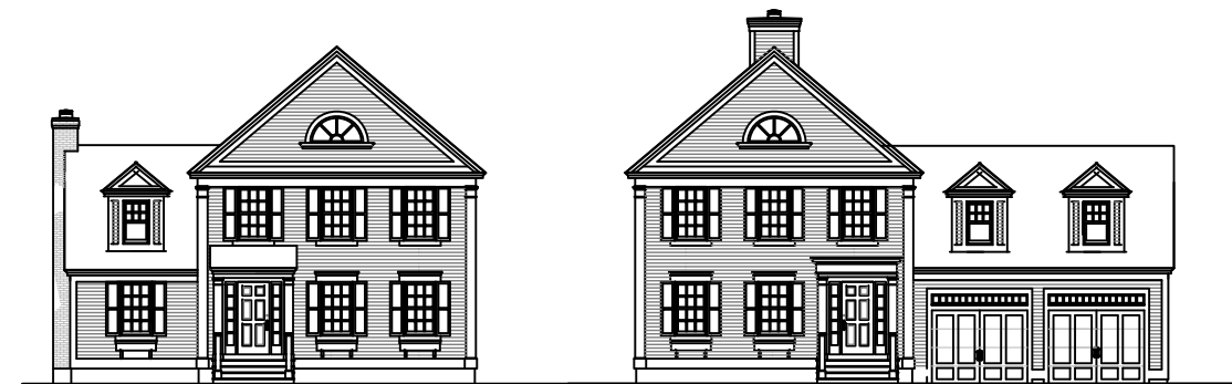
Figure 4: Additions to Main Building Form

When applied to the different building types and styles proposed for Milltown Commons, these types of variations offer almost limitless opportunities for creating a diverse architectural landscape while maintaining the appropriate village scale and character.