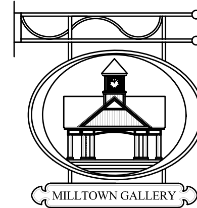
PROJECTING SIGN EXAMPLE

Carved wood or HDU painted panels with metal brackets