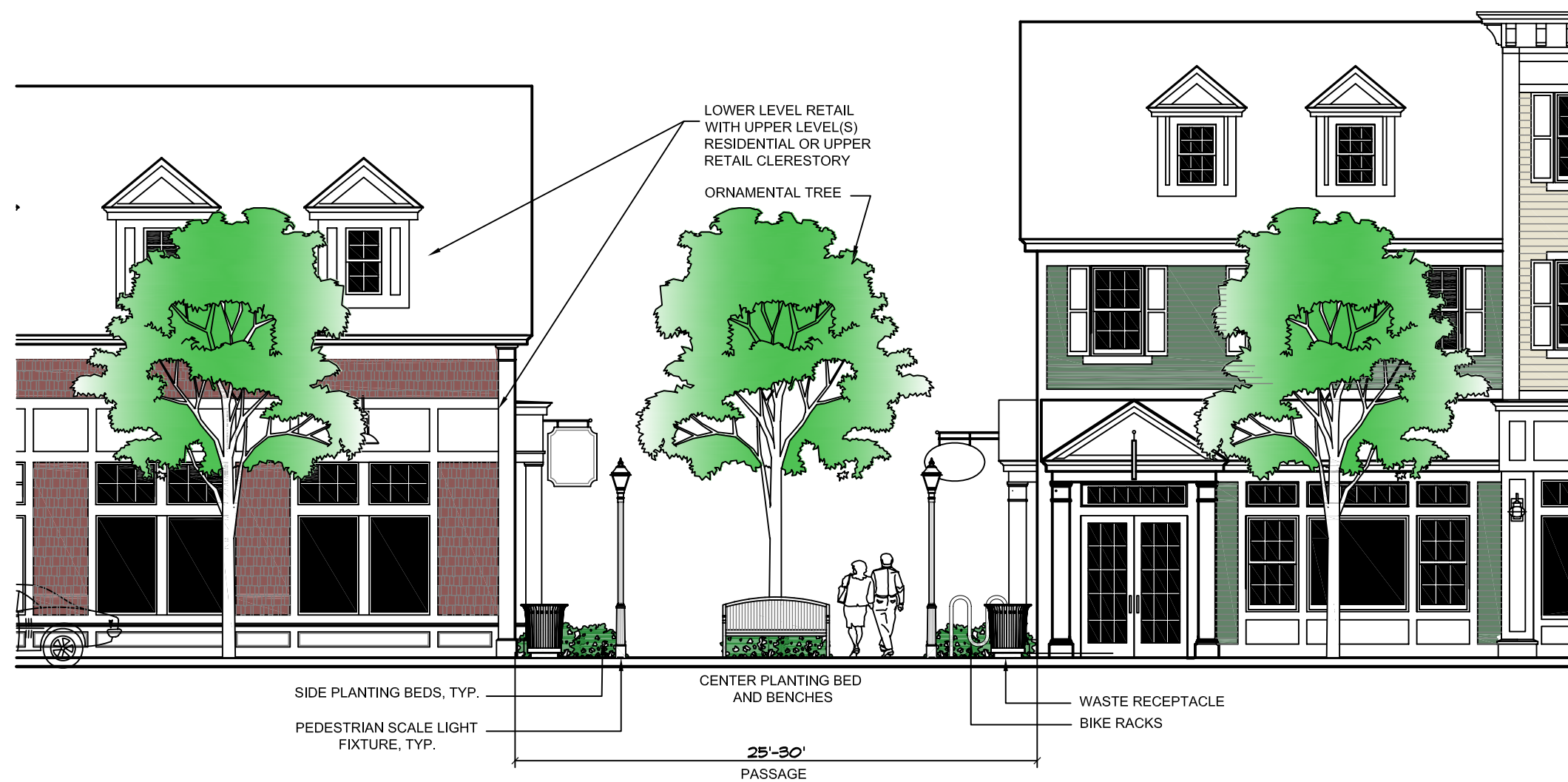
TYPICAL PEDESTRIAN PASSAGE