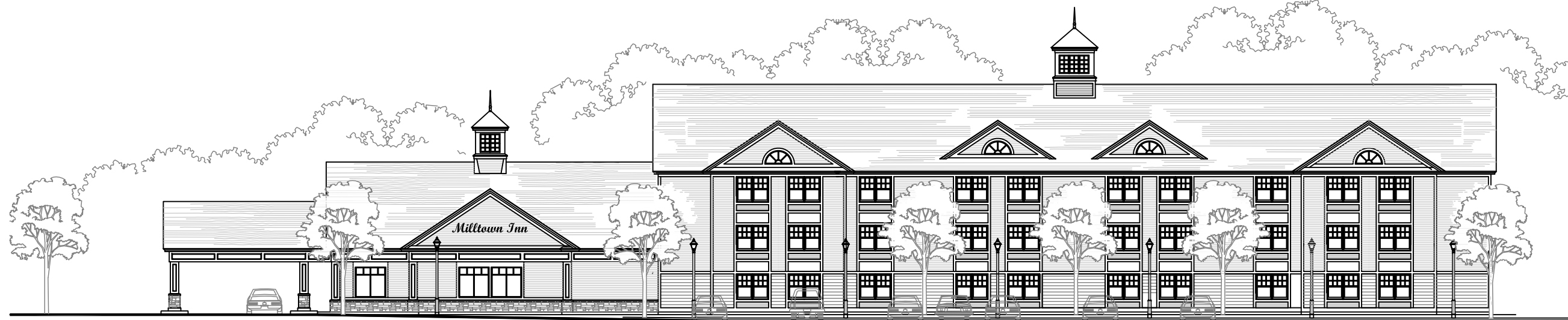
EAST ELEVATION-WEST MIRRORED