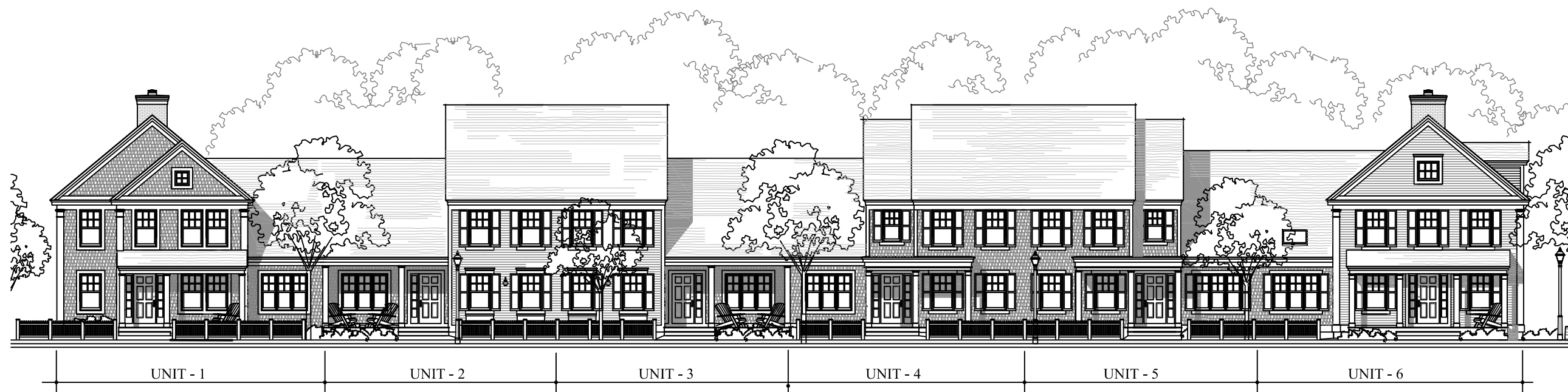
6 UNIT TOWNHOUSE - TYPE 1