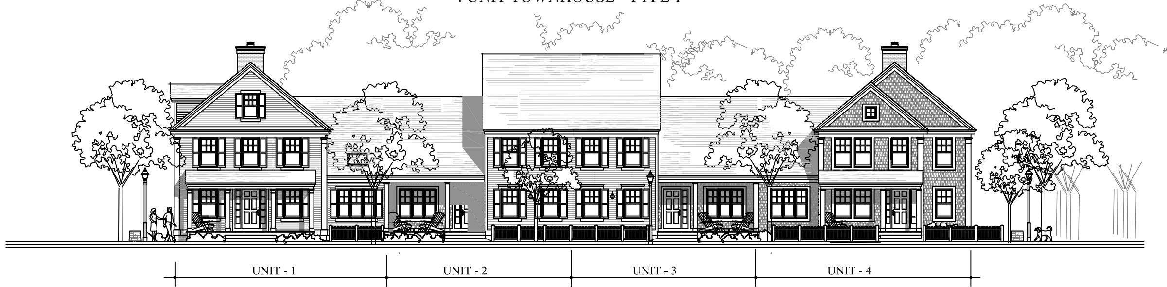
4 UNIT TOWNHOUSE - TYPE 2