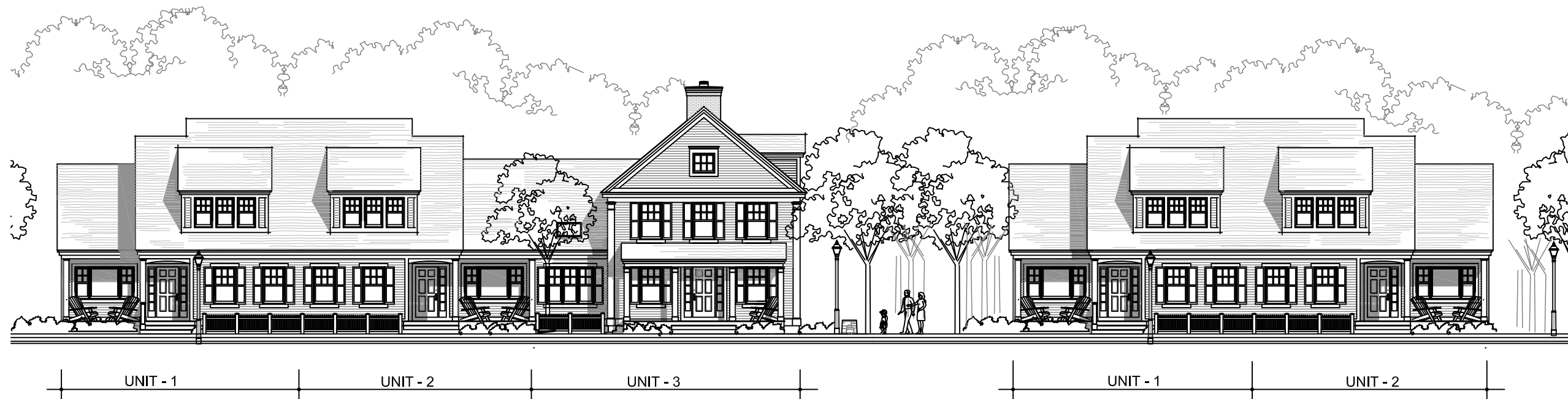
3 UNIT TOWNHOUSE - TYPE 2