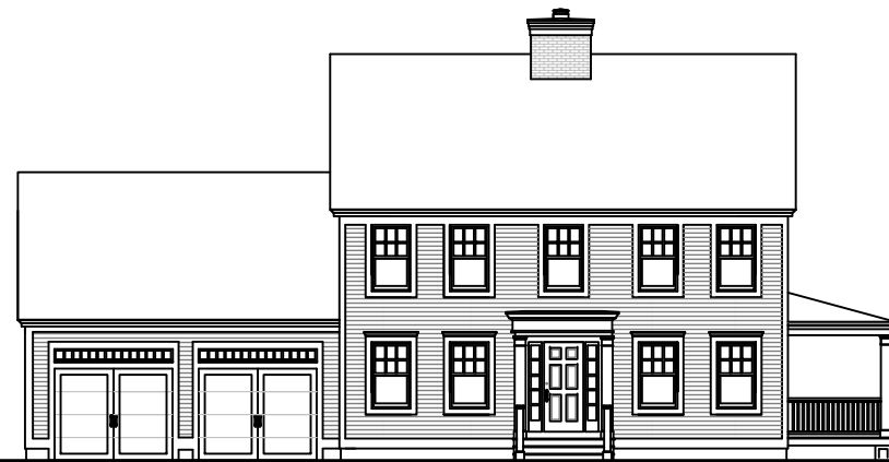
SINGLE FAMILY RESIDENCE - TYPE 5 ONE OR TWO CAR GARAGE @ FRONT