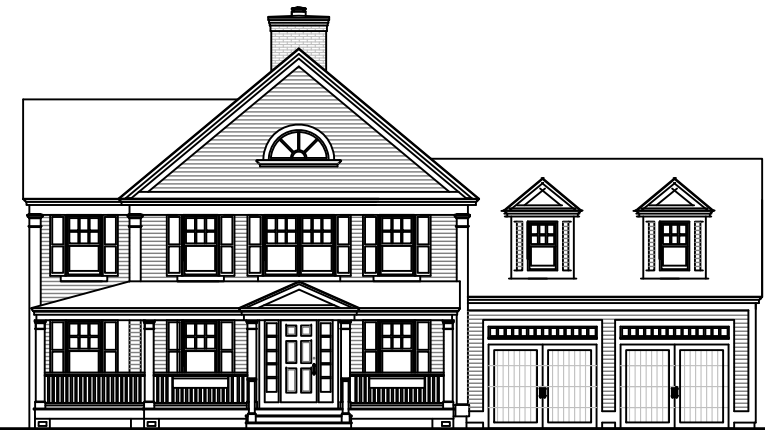
SINGLE FAMILY RESIDENCE - TYPE 7 ONE OR TWO CAR GARAGE @ FRONT