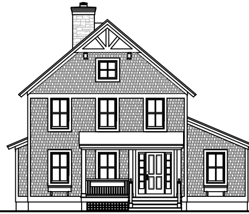
SINGLE FAMILY RESIDENCE - TYPE 3 ONE OR TWO CAR GARAGE @ SIDE OR REAR