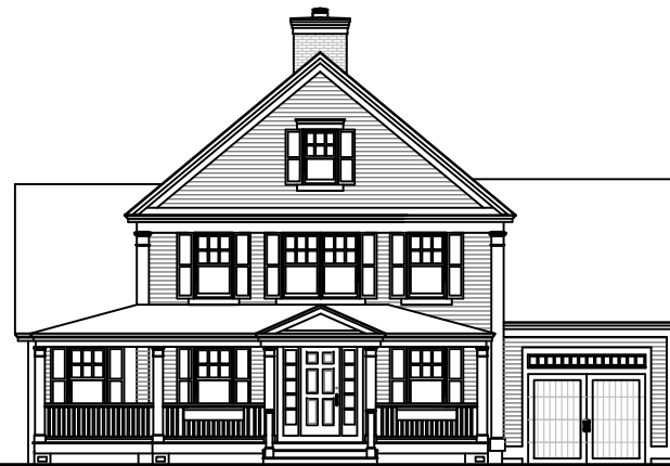
SINGLE FAMILY RESIDENCE - TYPE 6 ONE OR TWO CAR GARAGE @ FRONT