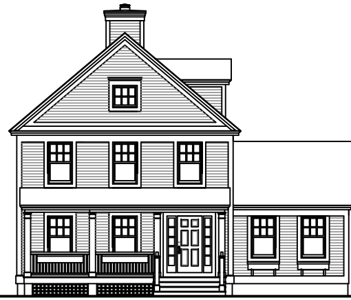
SINGLE FAMILY RESIDENCE - TYPE 1 ONE OR TWO CAR GARAGE @ SIDE OR REAR

The following conceptual designs illustrate the basic layouts for single family residences at Milltown Commons. As mentioned in the architectural character section, each of these designs may be modified through the use of different siding materials, porch designs, dormers, window layouts and color to provide a more interesting and varied architectural landscape.