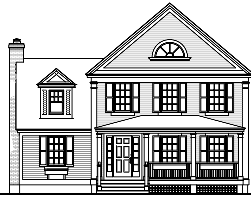
SINGLE FAMILY RESIDENCE - TYPE 2 ONE OR TWO CAR GARAGE @ SIDE OR REAR